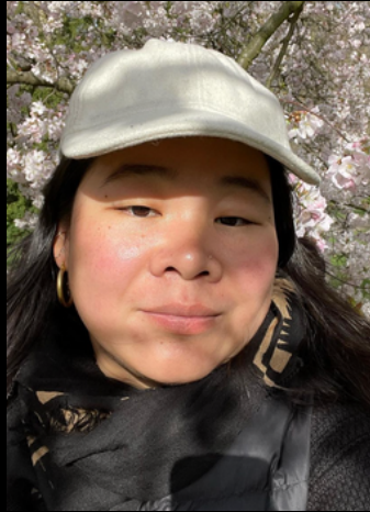
MEL NG PRODUCTION DESIGNER